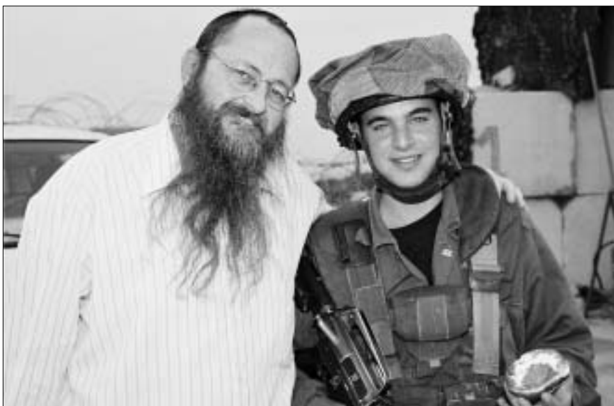
A personal connection with soldiers in Gush Katif

“We hope to see all Lubavitcher Chassidim taking part in this fight. The fight for shleimus ha’Aretz is an inseparable part of the Geula process. May we witness continued wonders and miracles. We invite all of you to come and visit us.”