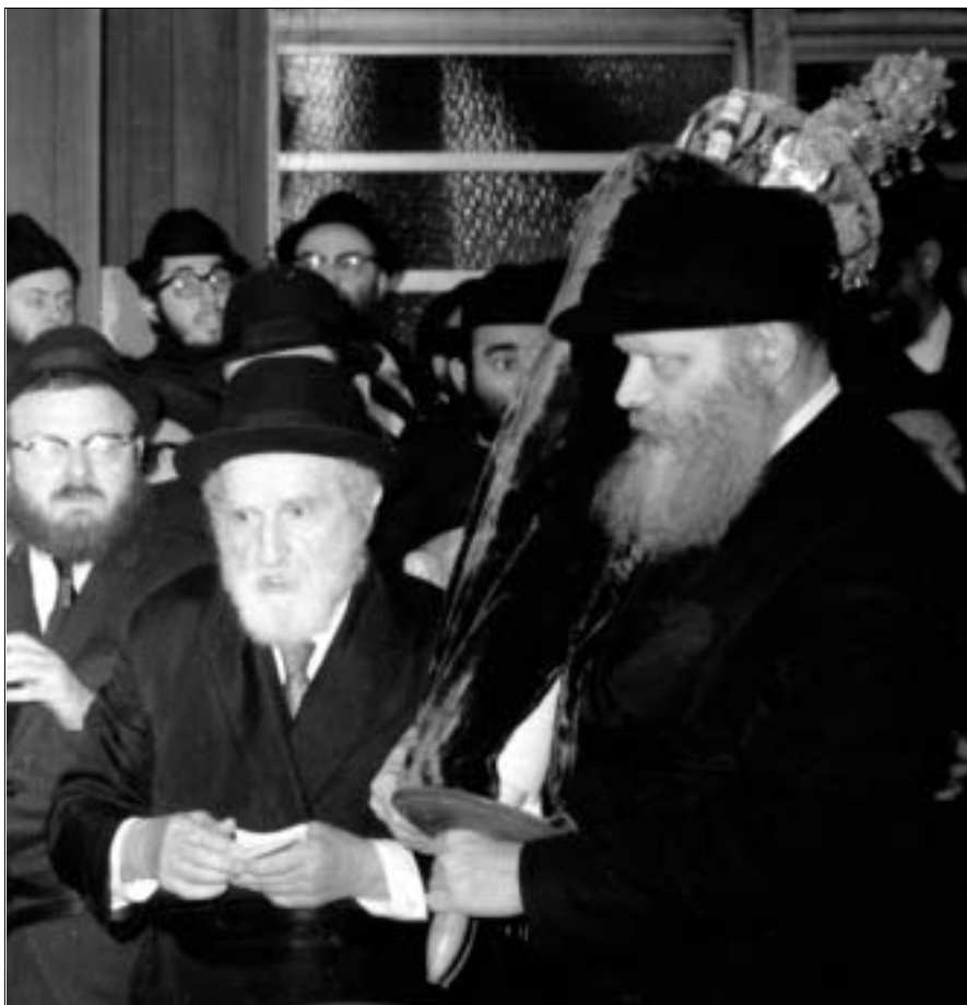
The Rebbe holding Moshiach's Seifer Torah