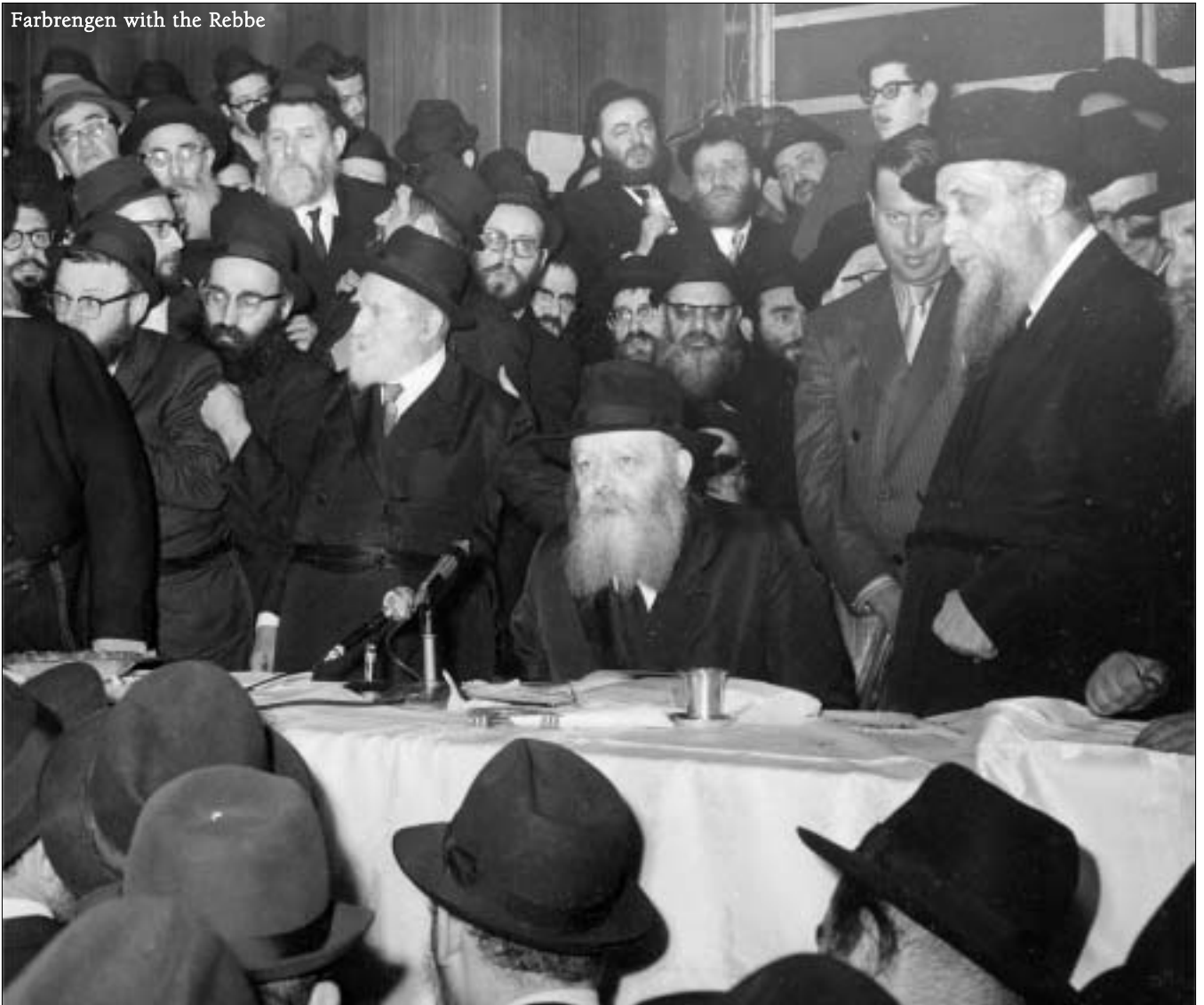
Farbrengen with the Rebbe