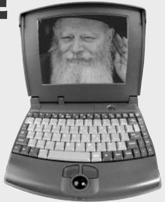
יחי אדונינו מורנו ורבנו מלך המשיח לעולם ועד

חתי"ת עניני גאולה ומשיח ומצ"ס שיעורים בלקוטי שיחות קודש