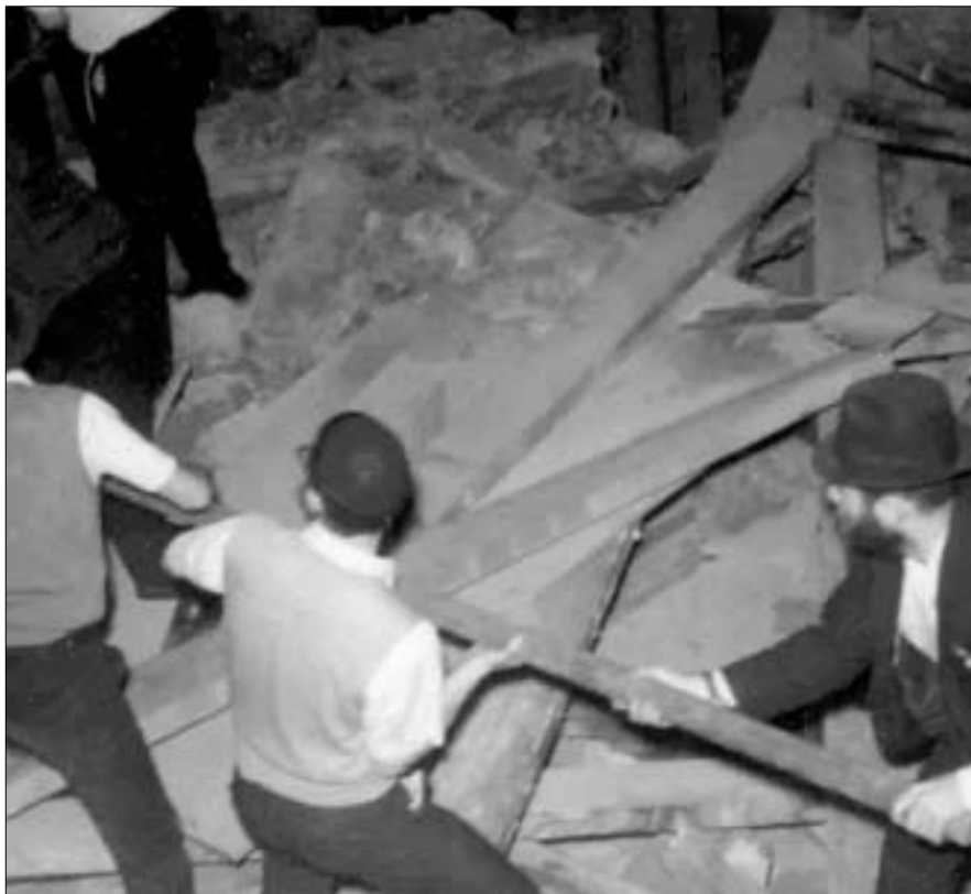
T'mimim involved in expanding 770

At the farbrengen on 15 Tammuz 5745 (1985), before the singing of Sh'Yibaneh Beis HaMikdash the Rebbe said: I assume that when Sh'Yibaneh is sung here, it is also sung in Olam HaBa and in the lower and upper Gan Eden. Whoever does not assume so, that is his prerogative.