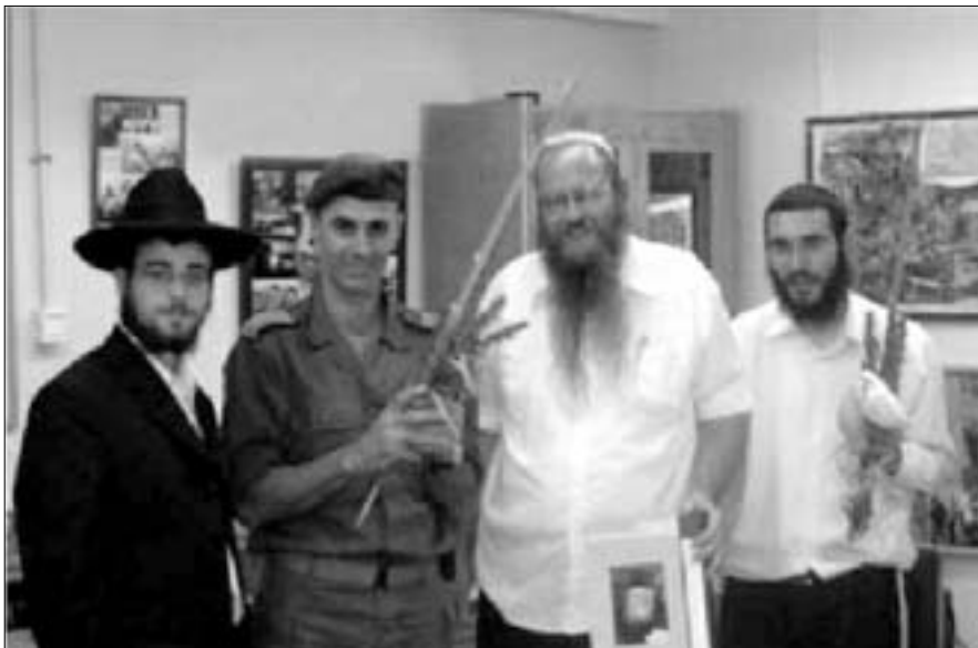
Visiting the IDF commander of the Gaza division – Sukkos 5754

service all the dozens of yishuvim in Gush Katif.