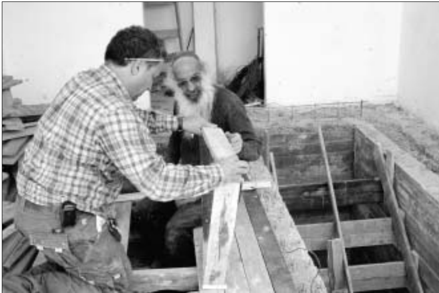
Building the mikva at Sa-Nur