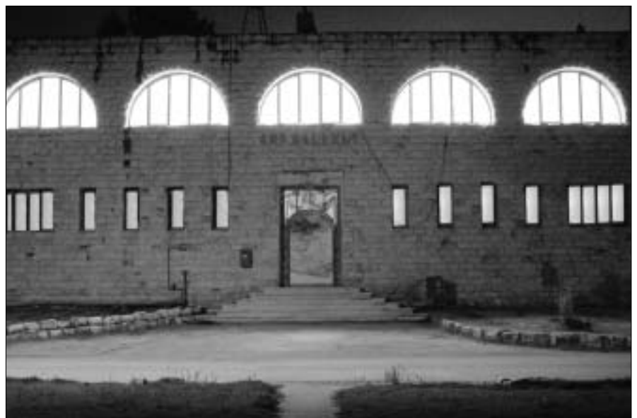
The British police station

Firstly, everybody is invited to come and live here, including Lubavitchers, of course. Secondly, the battle costs a lot of money.