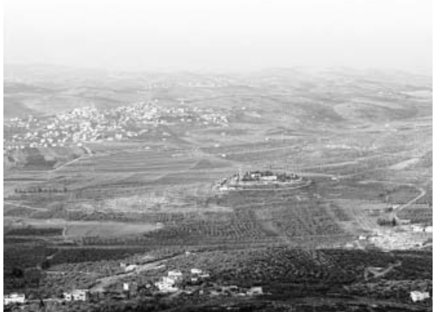
Sa-Nur is strategically located

Sa-Nur is on a crossroad which goes from Be'er Sheva till Afula. It's a vital and strategic location. This is precisely the reason why the British put a police station here. Later on, Sa-Nur served as a transit station