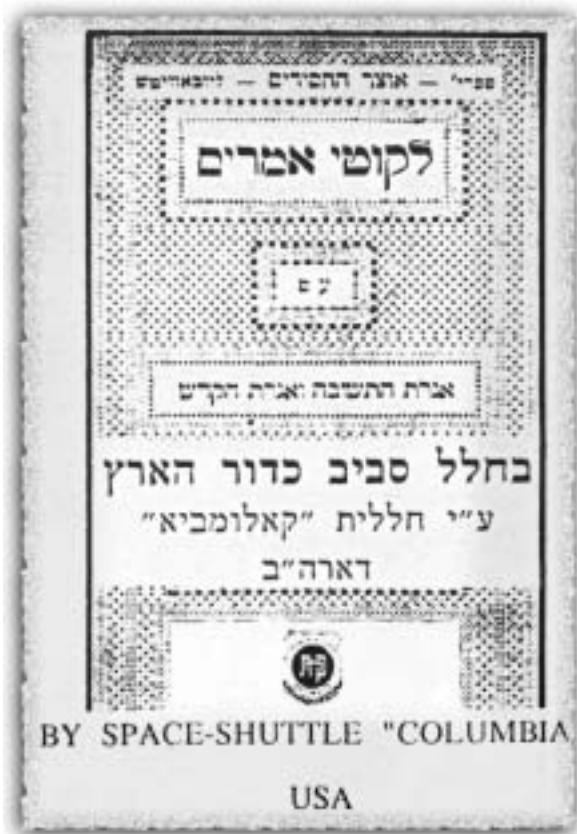
The Shaar Blatt of the Tanya that was to be printed in space