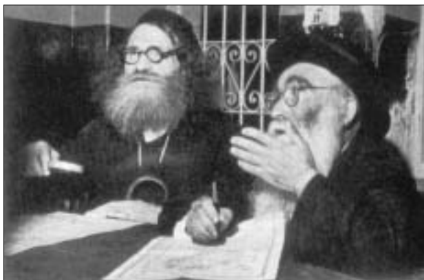
With Reb Aryeh Levin, z"l