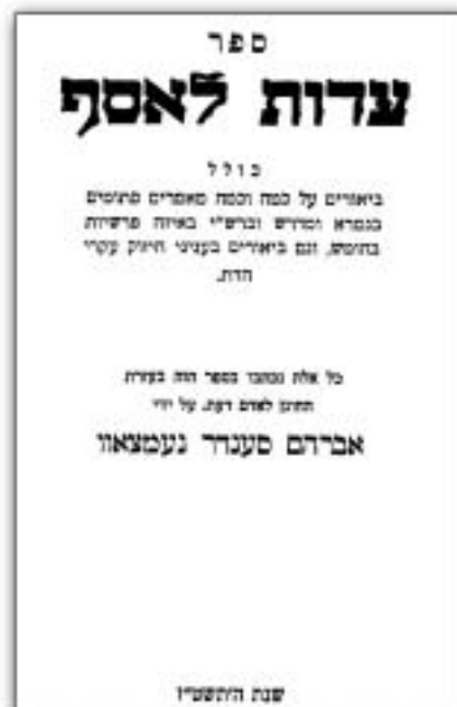
The frontispiece of Eidus L'Asaf

community agreed and he chose a new yeshiva, Yeshivas Tomchei T'mimim in the town of Lubavitch.