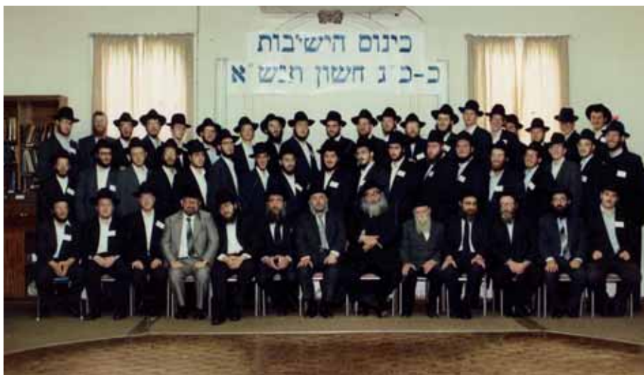
With the yeshiva students in the final year of his life