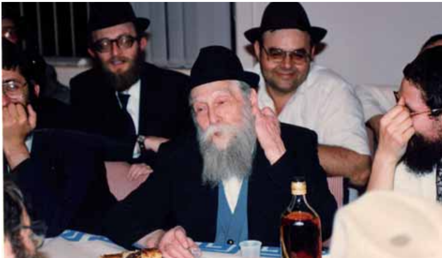
At a chassidishe farbrengen

a precious soul. Caring for the individual child was basic to the teachings of Yiddishkeit. This concern extended even to cleaning up an embarrassed second grader who had an ‘accident’ at school and then with kind words soothing the crying child. Not only was his heart open to his students, but indeed to each person he met. Whether young or old, educated or unlettered, Jew or I’havdil non-Jew, his kindness and respect were unlimited.