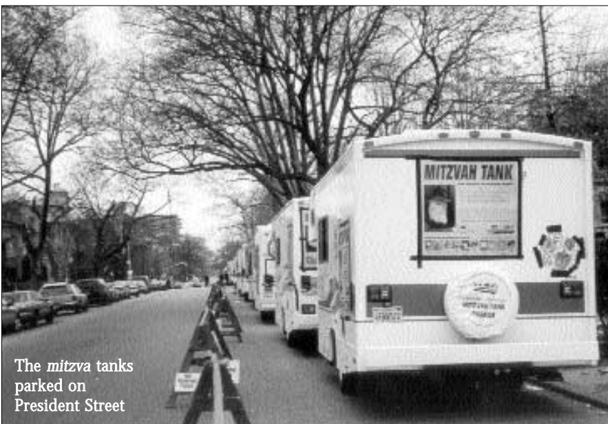
The mitzva tanks parked on President Street