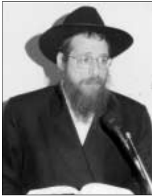
Rabbi Zushe Zilberstein