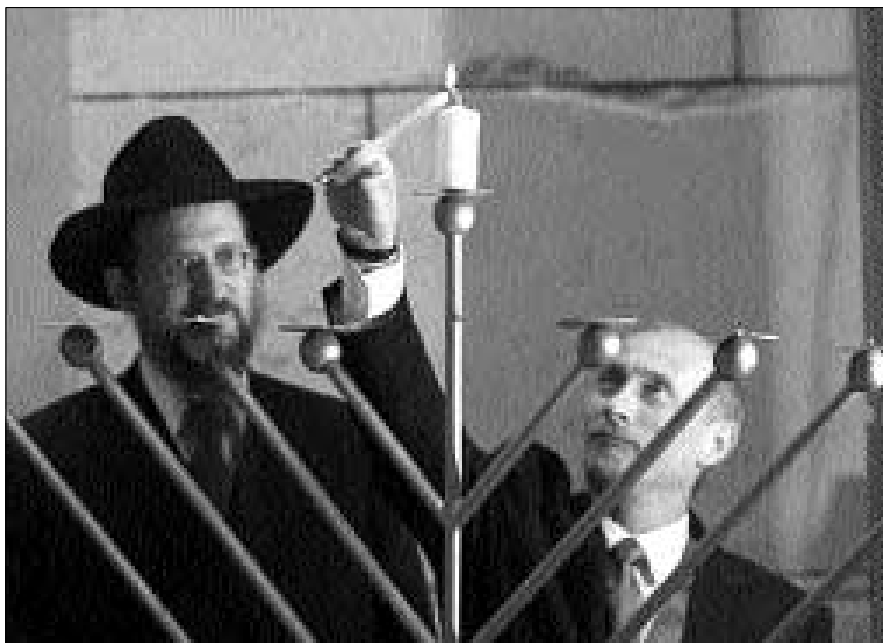
Rabbi Berel Lazar, Chief Rabbi of Russia, with President Vladimir Putin

its work in lighting up Russia with a positive light.