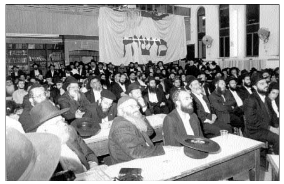
Participants at the kinus in Kfar Chabad

THE RABBANEI BEIS DIN CHABAD OF ERETZ YISROEL, MASHPIIM, SHLUCHIM, ANASH, AND TMIMIM JOINED TOGETHER FOR A NATIONAL KINUS TO MARK TEN YEARS SINCE THE REBBE SAID, "DO ALL THAT YOU CAN TO BRING ABOUT THE REVELATION OF MOSHIACH."