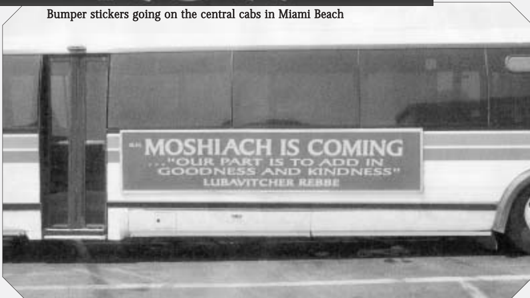
Picture of Moshiach signs running on two city buses in Miami Beach, Florida. The bus advertising is done through the city bus systems, which have a special rate for charitable causes (at least in Miami Beach).