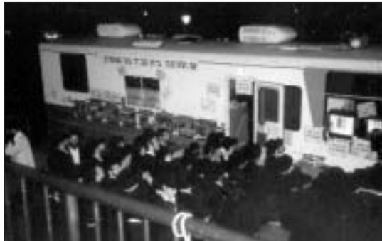
Anash and T'mimim by the Beis Chabad – Lev HaShomron presentation in front of 770

The three-day fundraiser targeted Crown Heights, but all donations from anyone anywhere are needed and welcome, and can be mailed to: 383 Kingston Ave. #352 Brooklyn, N.Y. 11213.