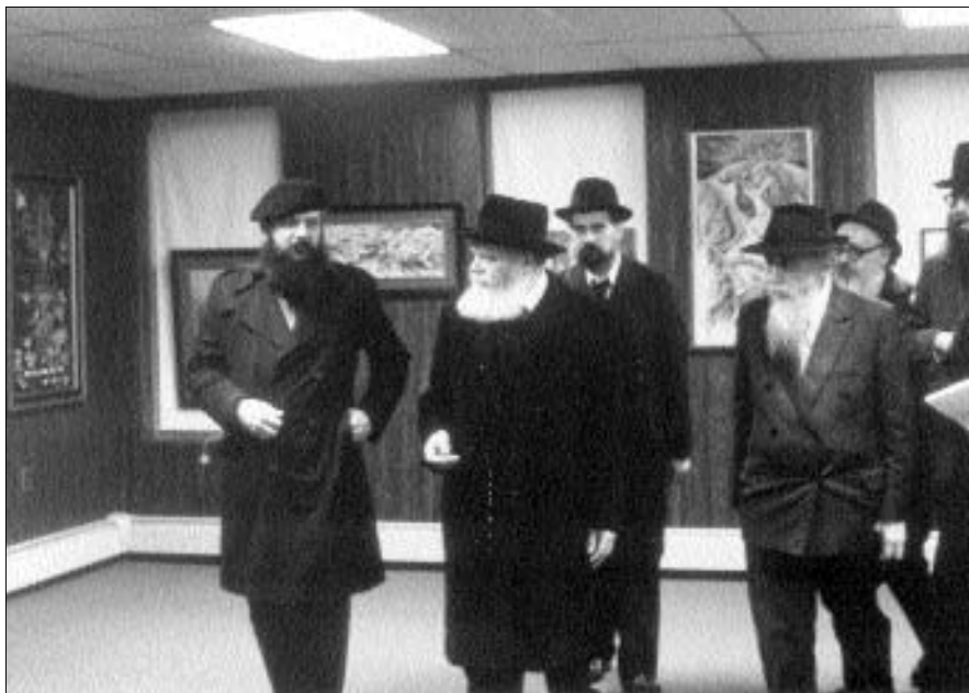
The Rebbe visiting Baruch Nachshon's art exhibit in 5739